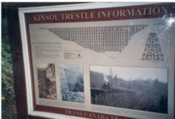
Kinsol Trestle on TransCanada Trail Nov. 04/05 (Cowichan River) Vancouver Island (815 ft. long 125 ft. above the Koksish River) Largest wooden trestle in the British Commonwealth. The construction started in 1911. All the timbers were cut and left at the site. Construction was halted due to 1 st World War. After the War the timbers left on site had deteriorated and had to be replaced. The trestle was completed in 1920. It was last used in 1979.